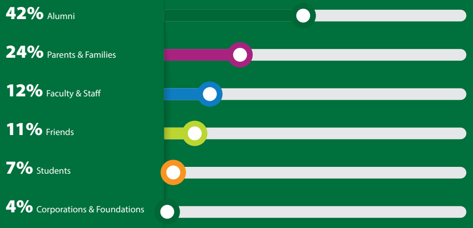
Percentages represent the number of donors in each category.