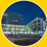
MASON SQUARE CAMPUS (FORMERLY ARLINGTON)

450 professional staff and 1000 student employees, providing service across four campuses and two instructional sites: